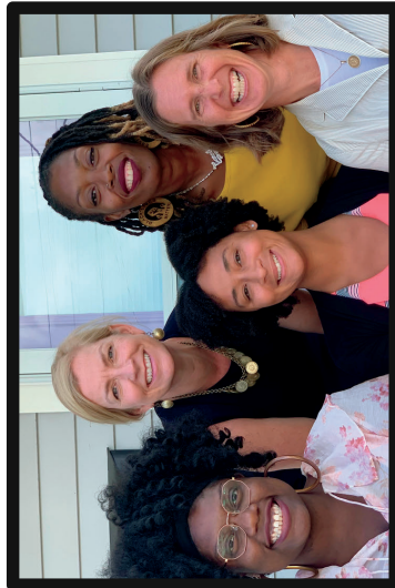
CURRENT URBAN HOPE TEAM